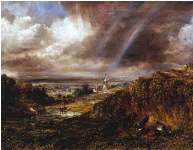
(Artist: John Constable Date: 1776-1837)

The heat of your deep blue flame my soul shall absorb! O mother of the radiant flames!