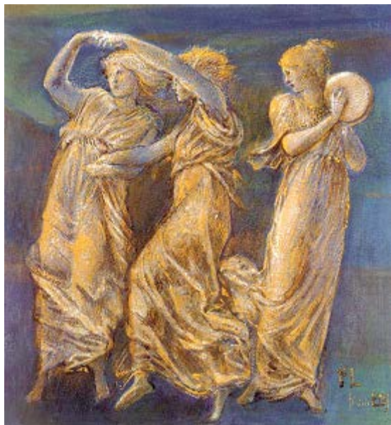
(Artist: Edward Burne-Jones Date: 1833-1898)

The whole cosmos has been transfixed by the glitter of the cosmic dance! O goddess of the celestials!