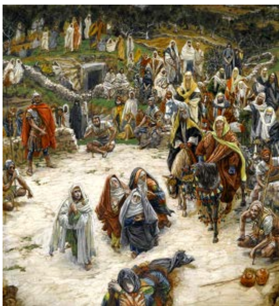
(Artist: James Tissot Date: 1836-1902)

With Your Cosmic Heat Every Soul Shall Melt! O Mother of Immense Strength!