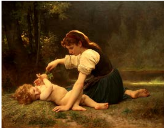
(Artist: William-Adolphe Bouguereau Date: 1865)

The heat of your deep blue flame my soul shall absorb! O mother of the radiant flames!