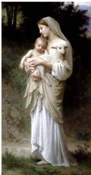
(Artist: William-Adolphe Bouguereau Date: 1865)

The whole cosmos has been transfixed by the glitter of the cosmic dance! O goddess of the celestials!